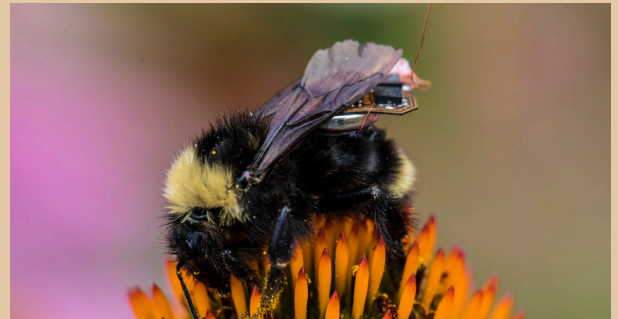
UW researchers have created a sensor package small enough to ride aboard a bumblebee.