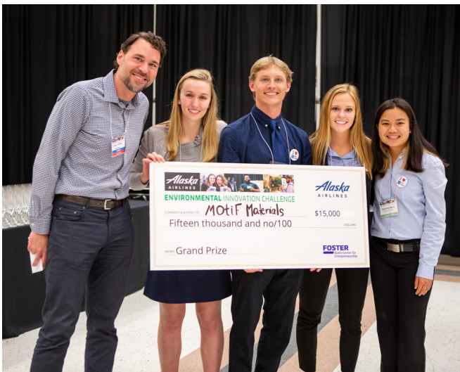
MOtiF Materials won first place at the 2019 Alaska Airlines Environmental Innovation Challenge.